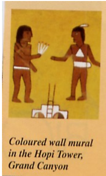
Coloured wall mural in the Hopi Tower, Grand Canyon

Thermo Auricular therapy or Hopi Ear Candles as it is also called- is an ancient holistic therapy which was used by Indian, Egyptian, Chinese Tibetan and American Indian cultures. Today this healing art is actively promoted by Cherokee, Mexican and European healers. German medical students are taught Thermo Auricular therapy as part of their medical practice. Hopi means people of peace. The Hopi community was the first settled Pueblo Indians of the North American continent. For many centuries they lived in harmony with nature and the original universal laws passed down to them by their ancestors. The Hopi people still live at the base of the Grand Canyon in the USA and they are greatly respected for their knowledge and spirituality. There are still ancient drawings visible in the caves of thermo auricular therapy being practiced.